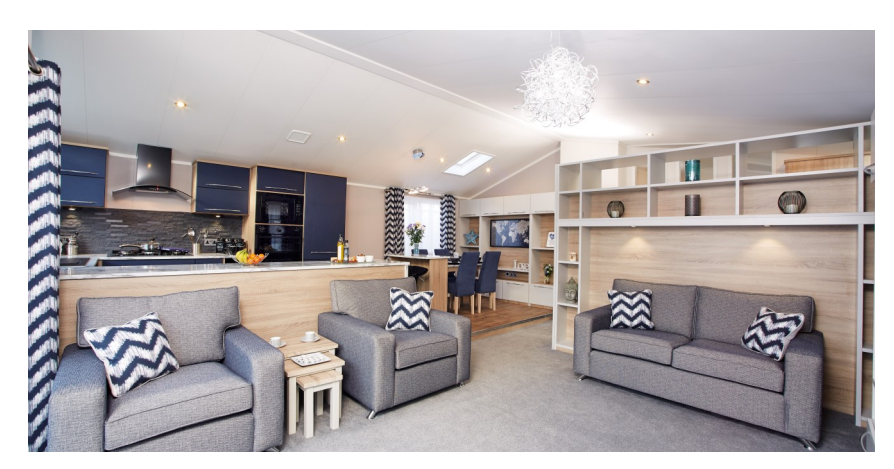
PCP SB 20200602 V010