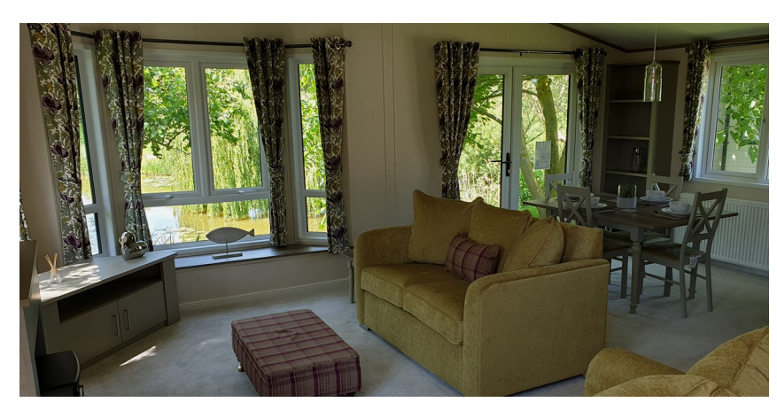
PCP SB 20200602 V010 8