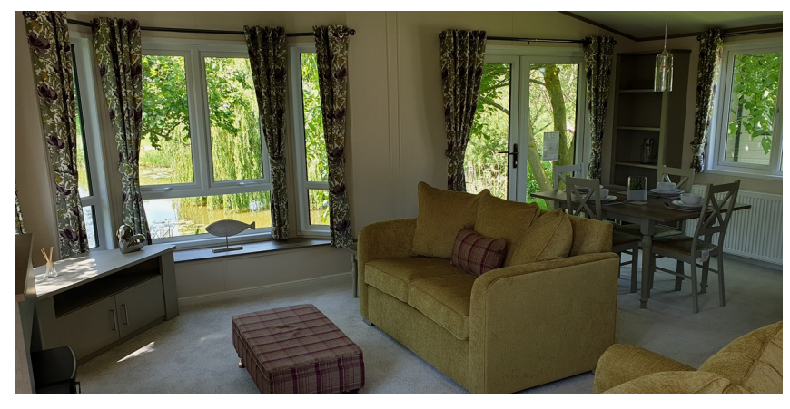
PCP SB 20200602 V010